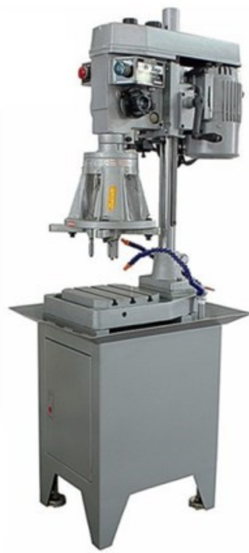
Work Table - Cooling System