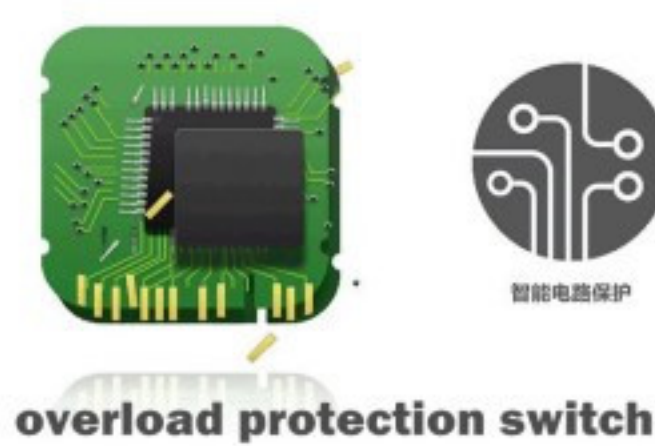
overload protection switch