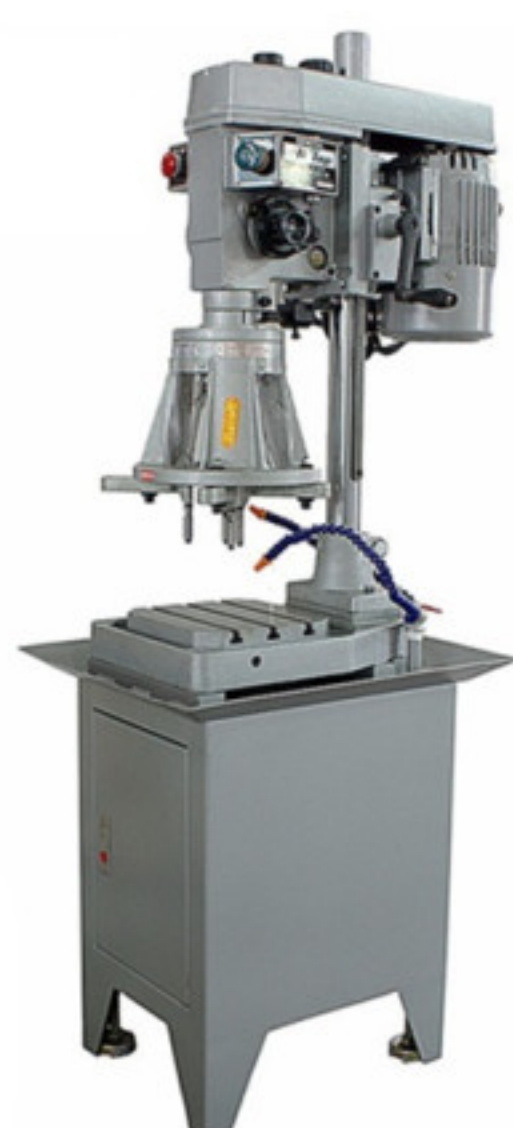
Work Table - Cooling System